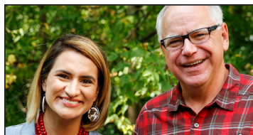
Tim Walz & Peggy Flanagan Governor & Lt. Governor