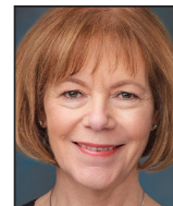
Tina Smith U.S. Senator