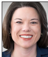
Angie Craig US Congress CD2