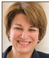
Amy Klobuchar U.S. Senator