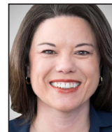
Angie Craig US Congress CD2