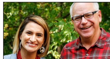
Tim Walz & Peggy Flanagan Governor & Lt. Governor