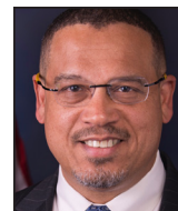
Keith Ellison Attorney General