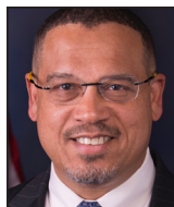
Keith Ellison Attorney General