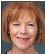
Tina Smith U.S. Senator