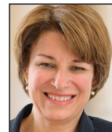
Amy Klobuchar U.S. Senator